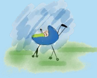
Angela's little little brother